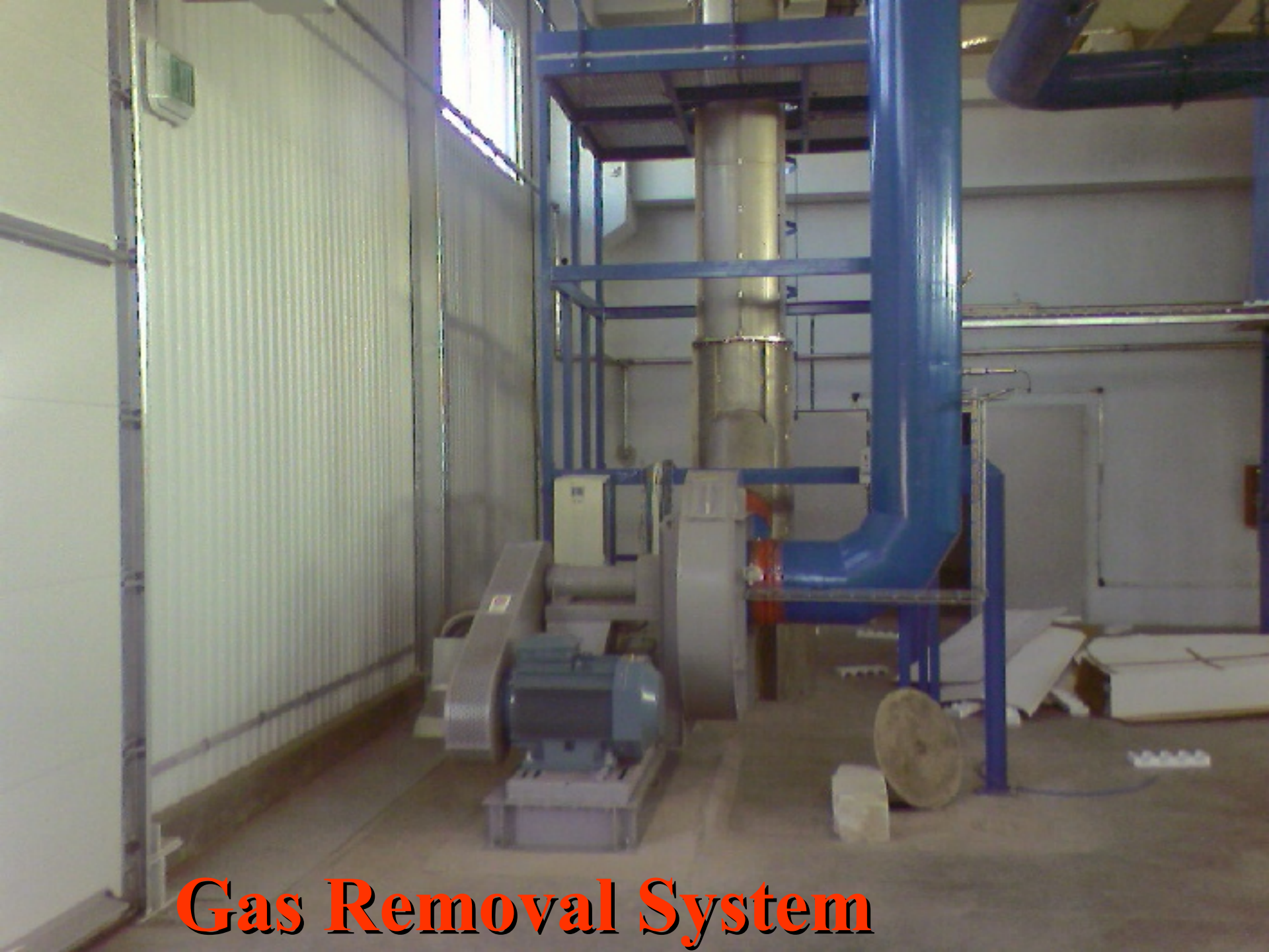
Gas Removal System