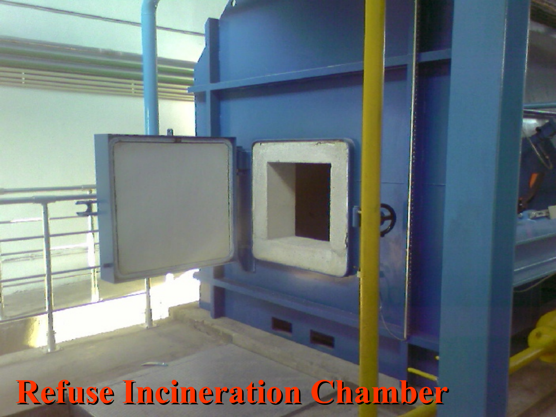
Refuse Incineration Chamber